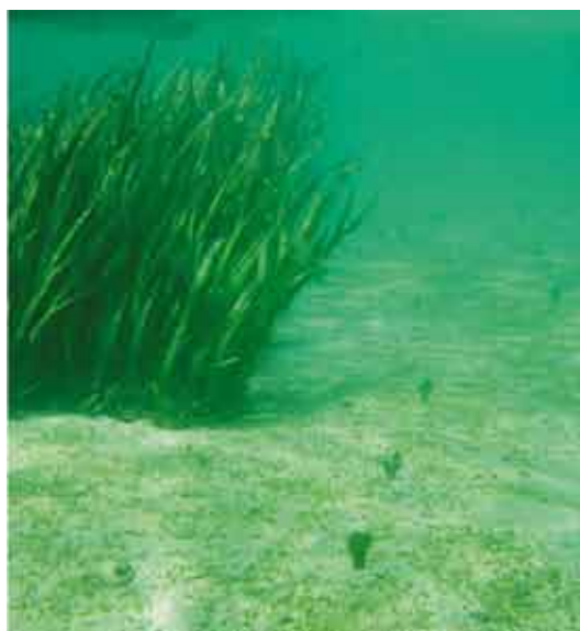
Seagrass diversity: Enhalus acoroides (large) and Halophila ovalis (very small) in Guam.

Sea level rise and altered currents: With future global warming, there may be a 1-5 m rise in the sea-water levels by 2100 (taking into account the thermal expansion of ocean water and melting of ocean glaciers, Overpeck et al. 2006, Hansen 2007, Rahmstorf 2007). Rising sea levels may adversely impact seagrass communities due to increases in water depths above present meadows (thereby reducing light), changed currents causing erosion and increased turbidity and seawater intrusions higher up on land or into estuaries and rivers (favouring land-ward seagrass colonisations, Short et al. 2001). Changing current patterns can either erode seagrass beds ("beds" are often used in this text synonymously to "meadows", but may indicate comparatively smaller entities) or create new areas for seagrass colonization. On the positive side, increases in current velocity within limits may cause increases in plant productivity (see Fact Box 9) reflected in leaf biomass, leaf width, and canopy height (Conover 1968; Fonseca and Kenworthy 1987, Short 1987).