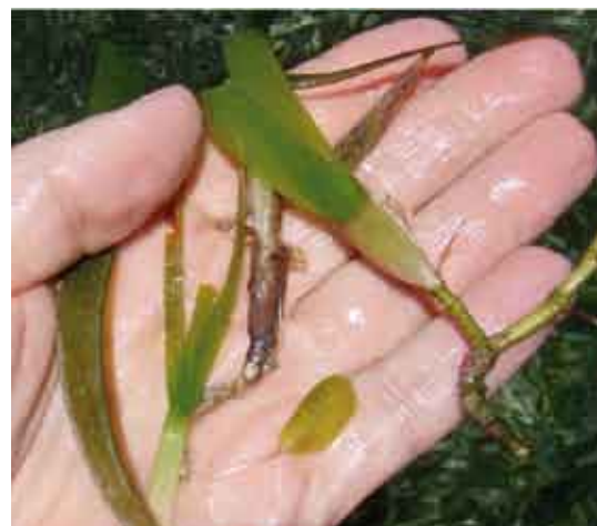
5 seagrass species, left to right: Enhalus acoroides , Cymodocea rotundata , Thalassia hemprichii , Halophila ovalis , and Cymodocea serrulata in Palau.

seagrass shoots vary from long, thin or strap-like leaf blades (up to 3 m long) to small, rounded paddle-shaped leaves (less than 1 cm long). The vegetative growth patterns of lateral branching and new shoot production often create dense meadows that form a canopy over the marine sediment. The plants’ structure, as well as the height of the canopy and the extent of the