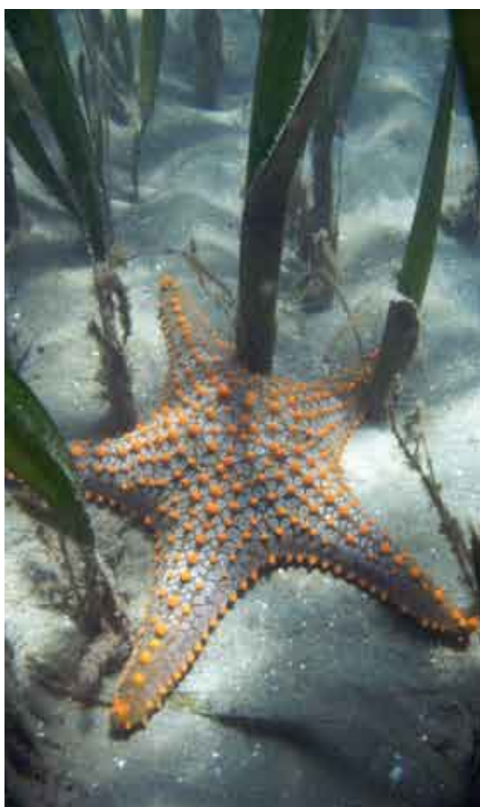
Pentaceraster sp. seastar in Enhalus acoroides meadow, inner near-shore, Tanga, Tanzania.

To effectively reduce the risk of losing seagrasses by climate change impacts and other anthropogenic disturbances, managers should identify and