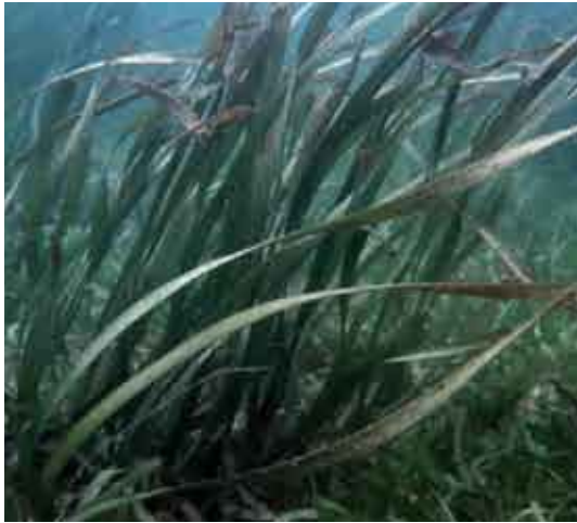
Enhalus acoroides (large) and Thalassia hemprichii (small) in Kosrae, FSM.

cies composition (in mixed meadows). Monitoring of water quality (including light penetration) and sediment composition could be of importance as early warnings of disturbances. Likewise, changes in other biotic factors (e.g. fauna and other plants) may indicate disturbances in the meadows or in the habitats they are connected with.