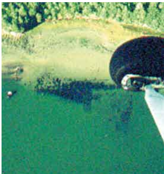
Restored Zostera marina bed from the air, New Hampshire, USA.

Site selection that favours seagrass growth is important (see Fact Box 9, see also Short et al. 2002a and Short and Burdick 2005 for quantitative site selection models). While collecting planting stocks (mature shoots or seeds), care must be taken to minimise damage of the donor meadows. Transplantation is labour intensive because it requires the painstaking harvest of shoots followed by hand or frame transplanting, limiting its applicability for large areas.