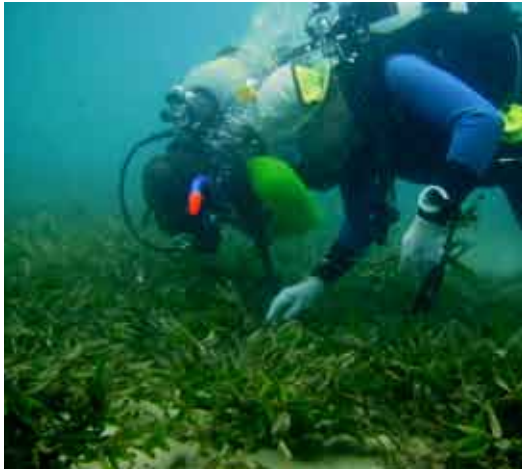
Sampling seagrasses in Madagascar, Thalassodendron ciliatum meadow, Madagascar.

the sediments, which in turn allows nutrients to be efficiently recycled from dead organic matter.