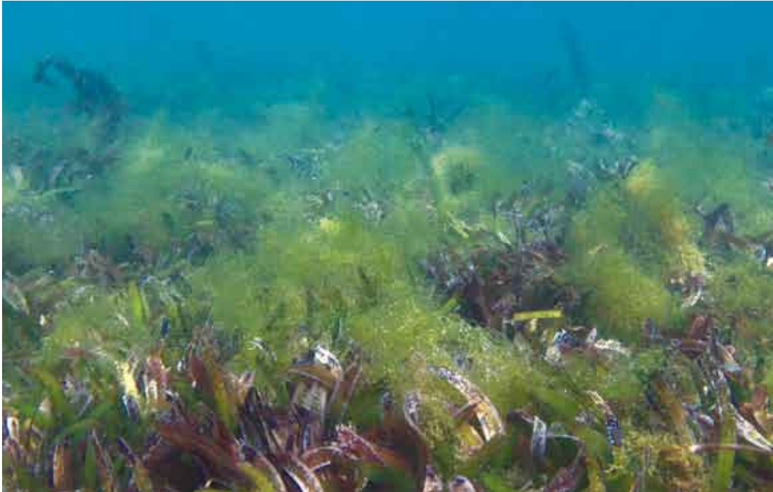
Seagrass bed, Thalassia hemprichii , covered with green algae, Tanga, Tanzania. Fast-growing algae can smother seagrasses as well as corals.

Human development can alter coastal ecology, often resulting in loss of seagrass habitats. Extensive losses, especially in developed and densely populated areas have been documented. An estimated 65% of Zostera marina in industrial parts of the northwest Atlantic was lost since the time of European settlement (Short and Short 2003). In other examples, 5000 hectares of seagrass meadows disappeared during the development of the rural area of Adelaide, Australia (Westphalen et al. 2004) and 58% was lost along the Swedish west coast over the last two decades (Baden et al. 2003).