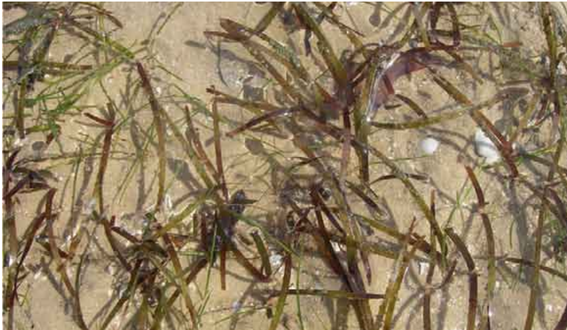
Cymodocea rotondata with red leaves from UV blocking pigments, Hainan Island, China.

pard and Rioja-Nieto 2005). Temperature stress on seagrasses will result in distribution shifts, changes in patterns of sexual reproduction, altered seagrass growth rates, metabolism, and changes in their carbon balance (Short et al. 2001, Short and Neckles 1999). When temperatures reach the upper thermal limit for individual species, the reduced productivity will cause plants to die (Coles et al. 2004). Elevated temperatures may increase the growth of competitive algae and epiphytes, which can overgrow seagrasses and reduce the available sunlight they need to survive. The response of seagrasses to increased water temperatures will depend on the thermal tolerance of the different species and their optimum temperature for photosynthesis, respiration and growth (Neckles and Short 1999). For tropical seagrasses, it was suggested that the photosynthetic mechanism becomes damaged at temperatures of 40-45°C (Campbell et al. 2005). High temperatures have likely caused large scale diebacks of Amphibolis antarctica and Zostera spp. in southern Australia (Seddon et al. 2000). For the temperate Zostera marina , experiments showed that a 5°C increase