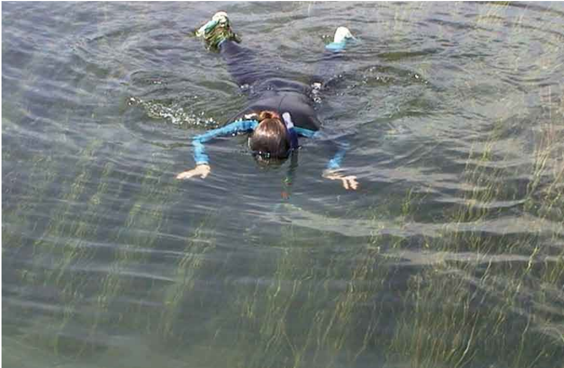
Graduate student snorkeling over a New Hampshire Zostera marina bed.

While only a few larger animals possess the ability to actually digest seagrass leaves (dugongs, turtles, geese, brant, and some herbivorous fish), the leaves often harbour a multitude of organisms such as algae and invertebrates, which serve as food for transient fish, as well as the permanent fauna within the seagrass meadow. Seagrass habitats also provide shelter and attract numerous species of breeding animals. Fish use the seagrass shoots as a protective nursery where they, and their fry, hide from predators. Likewise, commercially important prawns settle in the seagrass meadows at their post-larval stage and remain there until they become adults (Watson et al. 1993). Moreover, adult fish migrate from adjacent habitats, like coral reefs and mangrove areas, to the seagrass meadows to feed on the rich food sources within the seagrass meadows (Unsworth et al. 2008). Many small subsistence fishing practices, such as those in Zanzibar (Tanzania), are totally dependent on seagrass meadows for their fishing grounds (Torre-Castro and Rönnbäck 2004); coastal popu-