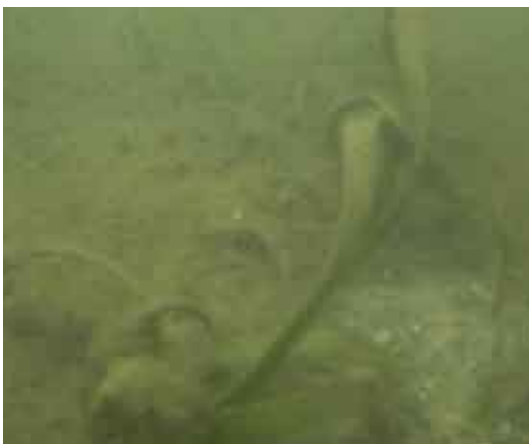
Near a Palau river mouth, Enhalus acoroides is coated with sediment after a heavy rain storm event.

in the normal seawater temperature caused a significant loss in shoot density; however, it seemed that a high genetic diversity within the meadows increased its possibility to recover from such extreme temperatures (Reusch et al. 2005, Ehlers et al. 2008). At the margins of temperate and tropical bioregions (Short et al. 2007), and within tidally restricted embayments where plants are growing at their physiological limits, increased temperature will result in losses of seagrasses and/or shifts in species composition. Seagrass distribution and abundance may also be altered through the effects of increased temperature on flowering and seed germination (de Cock 1981, McMillan 1982, Phillips et al. 1983, Durako and Moffler 1987).