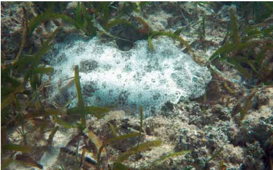
Flatfish in seagrass, Cymodocea rotundata and Thalassia hemprichii, behind the reef flat of a fringing reef of hard substrate mixed with sand, Tanga, Tanzania.

This paper presents an overview of seagrasses, the impacts of climate change and other threats to seagrass habitats, as well as tools and strategies for managers to help support seagrass resilience.