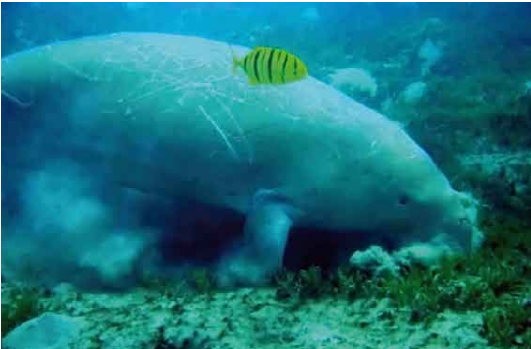
Dugong in seagrass: Halophila stipulacea bed, Red Sea, Egypt

reefs, while in the tropics critical links are with mangrove forests and coral reefs. Seagrasses provide habitats for rich faunal assemblages and seagrass meadows are recruitment and nursery areas for fish and crustaceans (Green and Short 2003). The “seagrass fauna” includes animals at many trophic levels, the most visible herbivores being dugongs, manatees and sea turtles in tropical, and swans and geese in temperate, waters. Seagrasses are also a direct food source for sea urchins and many species of fish (Pollard 1984, Heck and Valentine 1995). However, beyond direct consumption, seagrasses provide crucial food web resources for animals and for people. Particularly important are subsistence gleaning for protein on tropical coasts by villagers, nursery resources for commercially important finfish and shellfish species, and habitats for commercial and recreational bivalve fisheries.