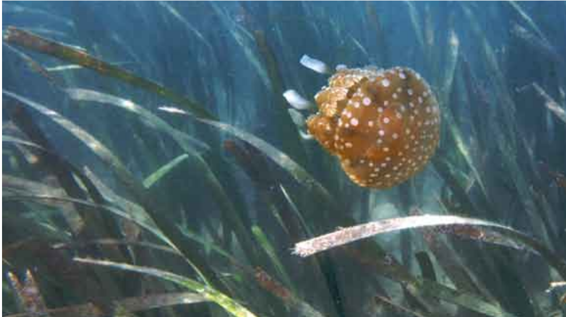
Jellyfish over Enhalus acoroides meadow, inner near-shore, Tanga, Tanzania.

Seagrasses are experiencing a worldwide decline due to a combination of climate change impacts and other anthropogenic factors. Seagrass areas along coastlines that are already affected by human activities (causing e.g. sedimentation, nutrient enrichment, eutrophication and other environmental destruction) are most vulnerable to climate change impacts. Mitigating strategies (e.g. limiting greenhouse gas emissions) that affect the rate and extent of climate change impacts should be coupled with resilience-building adaptation strategies (Johnson and Marshall 2007). Managers can promote policies that protect and conserve seagrasses, while also assisting in mitigation efforts by raising awareness about the vulnerability of seagrass habitats to coastal impacts. Managers can also contribute knowledge about climate change impacts on tropical and temperate marine ecosystems to help set mitigation targets (Johnson and Marshall 2007).