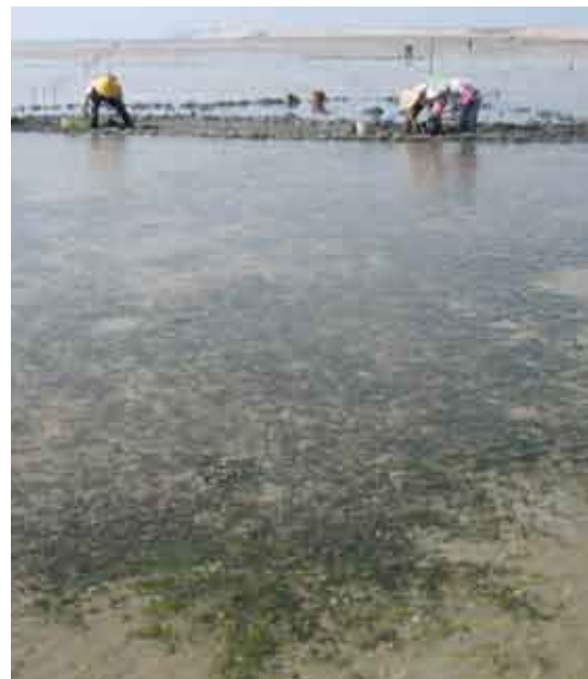
Fishers harvesting clams from an aquaculture lease in a seagrass bed (Zostera japonica and Halophila ovalis) in Bei Hai, China.

pH: Concomitantly with increased dissolved CO 2 levels, the pH of oceanic waters will decrease. This is because CO 2 in solution forms an equilibrium with carbonic acid, which dissociates to add