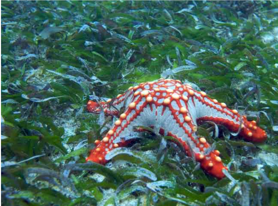
The sea star Protoreaster linckii on the seagrass Thalassia hemprichii on an intertidal reef flat, Tanga, Tanzania.

There is growing evidence that seagrasses are experiencing declines globally due to anthropogenic threats (Short and Wyllie-Echeverria 1996, Duarte 2002, Orth et al. 2006). Runoff of nutrients and sediments that affect water quality is the greatest anthropogenic threat to seagrass meadows, although other stressors include aquaculture, pollution, boating, construction, dredging and landfill activities, and destructive fishing practices. Natural disturbances such as storms and floods can also cause adverse effects. Potential threats from climate change include rising sea levels, changing tidal regimes, UV radiation damage, sediment hypoxia and anoxia, increases in sea tempera-