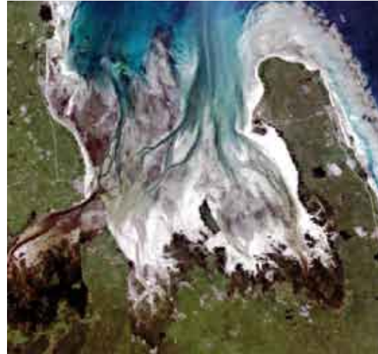
Satellite image of Chwaka Bay, Zanzibar, Tanzania.

seagrass beds (Gullström et al. 2006). It should be remembered that extensive ground-truthing is necessary for verifying all remote mapping data (Duarte and Kirkman 2001).