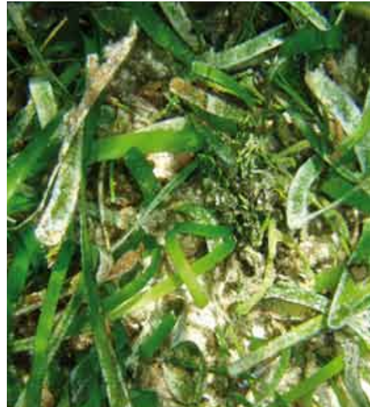
Six seagrass species can be found in this photo taken in Palau: Enhalus acoroides , Cymodocea rotundata , Cymodocea serrulata , Thalassia hemprichii , Syringodium isoetifolium , and Halodule uninervis .

Some seagrasses acclimate to changing environmental conditions better than others. Intra-meadow genetic diversity has been shown to be a key factor supporting the resilience of Zostera marina , and efforts should be devoted to investigating such mechanisms in other key seagrasses.