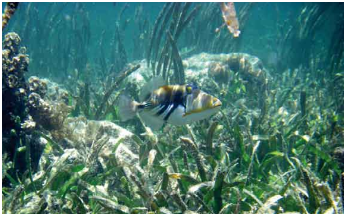
Thalassia hemprichii with Enhalus acoroides in the background, Kosrae, Federated States of Micronesia.

Seagrasses are submerged marine flowering plants forming extensive meadows in many shallow coastal waters worldwide. The leafy shoots of these highly productive plants provide food and shelter for many animals (including commercially important species, e.g. prawns), and their roots and rhizomes are important for oxygenating and stabilising bottom sediments and preventing erosion. The monetary value of seagrass meadows has been estimated at up to $19,000 per hectare per year, thus being one of the highest valued ecosystems on earth.