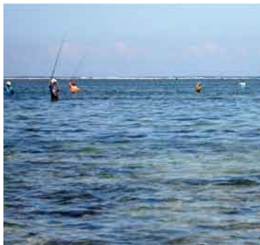
Fishermen in seagrass, Bali, Indonesia.

Seagrasses have had many traditional uses (cf. Terrados and Borum, 2004). They have been used for filling mattresses (with the thought that they attract fewer lice and mites than hay or other terrestrial mattress fillings), roof covering, house insulation and garden fertilisers (after excess salts were washed off). They have also been used in traditional medicine in the Mediterranean (against skin diseases) and in Africa (Torre-Castro and Rönnbäck 2004). Seagrass seeds of several species are sometimes used as a food source.