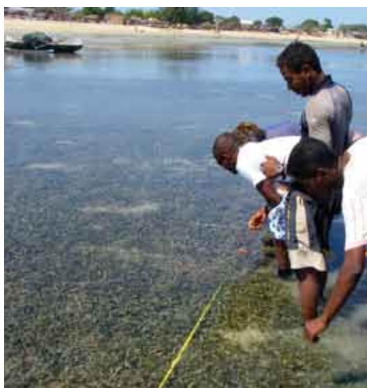
Sampling an intertidal seagrass meadow in Ifaty, Madagascar.

Restoration strategies may help seagrasses to cope with climate change and other anthropogenic impacts and introducing founder populations can speed up ecosystem recovery following a disturbance (Orth et al. 2006b). For example, Halodule wrightii is a pioneering species and has been planted as a habitat stabiliser prior to transplanting Thalassia testudinum and other seagrasses in restoration efforts (Durako et al. 1992, Fonseca et al. 1998).