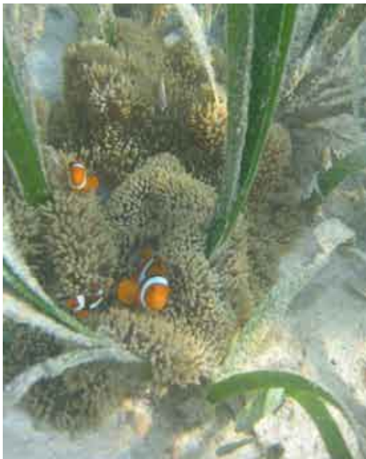
Seagrass, Enhalus acoroides, with sea anemone and clown fish, Indonesia.

Areas where seagrass beds are proven as beneficial to adjacent ecosystems like coral reefs and mangroves should definitely be granted protection. Mangroves, reefs and seagrasses often have a synergistic relationship, based on connectivity, which exerts a stabilising effect on the environment. Seagrasses and mangroves stabilise sediments, slow water movements and trap heavy metals and nutrient rich run-off, thus improving the water quality for corals and fish communities. Seagrasses and mangroves filter freshwater discharges from land, maintaining necessary water clarity for coral reef growth. Coral reefs, in turn, buffer ocean currents and waves to create a suitable environment for seagrasses and mangroves. Mangroves also enhance the biomass of coral reef fish species. It has been shown that seagrass meadows are important intermediate nursery habitats between mangroves and reefs that increase young fish survival (Mumby et al. 2004, Unsworth et al. 2008). Protected area managers