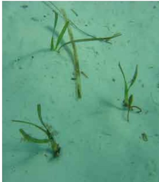
Propagules and seedlings : Posidonia australis in Western Australia.

spp.) to “climax” species that spread slowly and build up large carbon reserves (e.g. Thalassia spp. and Posidonia oceanica ). For Posidonia , extensive rhizome mats, which form under the living meadows, can be over 3000 years old (Mateo et al. 1997).