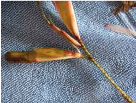
Thalassodendron ciliatum in Mombassa, Kenya: flowering shoot with viviparous seedling.

must in seagrasses support not only their above-ground tissues but also their underground roots and rhizomes (and the latter can have a biomass exceeding that of the shoots). Thus, seagrasses must in principle photosynthesise more than e.g. macroalgae in order to support the growth of the entire plants. On the other hand, the roots of seagrasses aid them in the uptake of nutrients; thus, seagrasses can thrive in nutrient-poor waters provided that the substrate is rich in nutrients. What, then, is the limiting factor for the growth and productivity of seagrasses as based on their photosynthetic rates? Under natural conditions, light, salinity, the inorganic carbon source, nutrient availability and temperature can all limit the growth rates of seagrasses.