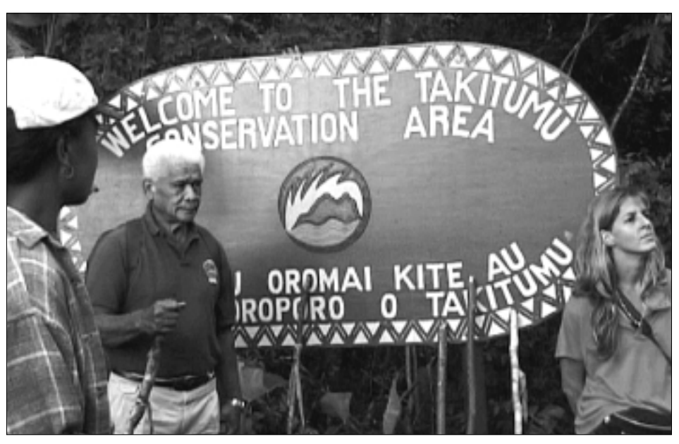
CACC member and visitors with sign made locally for the TCA

It has been found that direct regular consultation with the wider landowning groups is a better way to relay the economic details generated by the ecotourism venture. This was demonstrated when the project held a meeting for one of the landowning tribes at the end of 1999. Lack of knowledge and misunderstandings existed on the part of many of those at the meeting concerning the funds generated by the ecotourism venture. Misconceptions were clarified at the meeting.