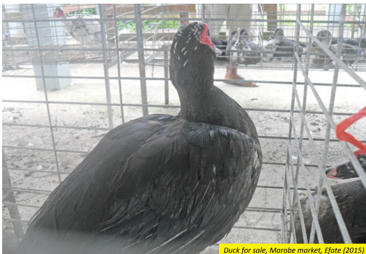
Duck for sale, Marobe market, Efate (2015)

In this regard, efforts will be made to improve existing breeding programmes through collaboration with relevant stakeholders. The government will promote the use of recognized experts to formulate superior breeding programmes and to train local officials and farmers on improved breeding methods. The government will also establish sound animal conservation policies to ensure the current national genetic materials are properly maintained.