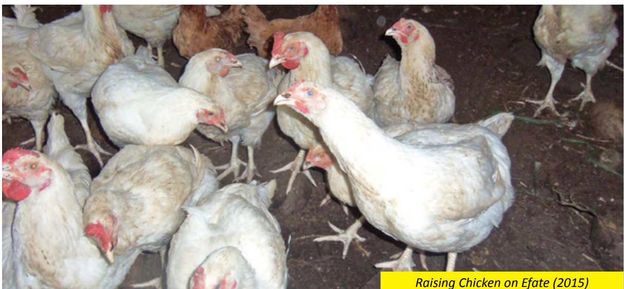
Raising Chicken on Efate (2015)

“To provide the enabling policy environment and recognises latest technologies and knowledge that increases overall productivity of Vanuatu’s Livestock sector and protects it from diverse risks by ensuring that critical services and products are provided equitably to the people of Vanuatu through collaborative arrangements among multiple sectors”.