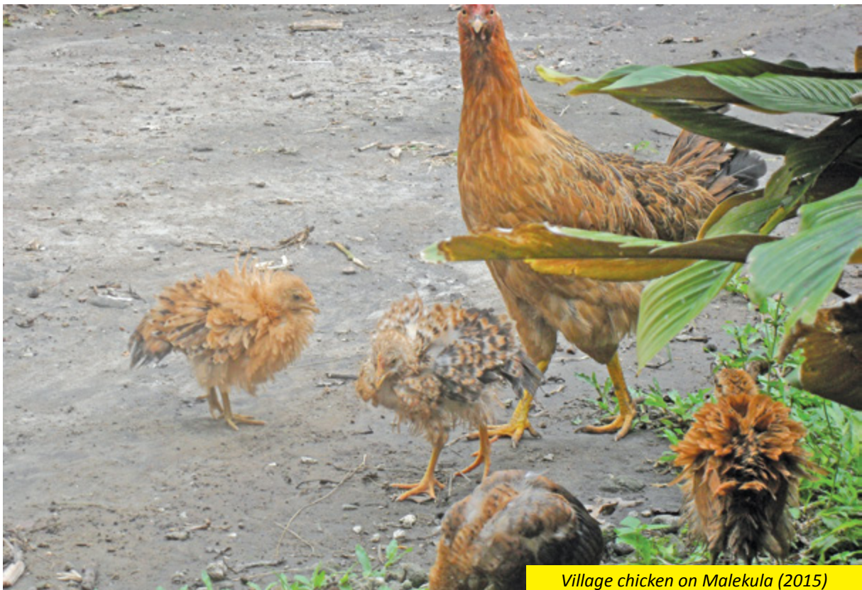
Village chicken on Malekula (2015)

In order to recapture a greater share of the formal market sector and to increase benefits of livestock farming to smallholder farmers the sub-sector will promote and create incentives to attract more people into livestock farming. The industry must develop a sound policy platform to develop the sector, bring in new genetic materials to improve its national herds and pursue the national livestock restocking program to increase animal numbers at the smallholder farms level.