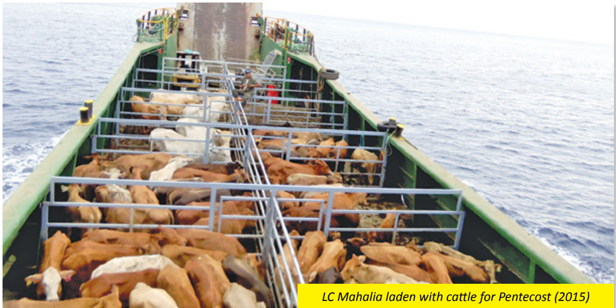
LC Mahalia laden with cattle for Pentecost (2015)