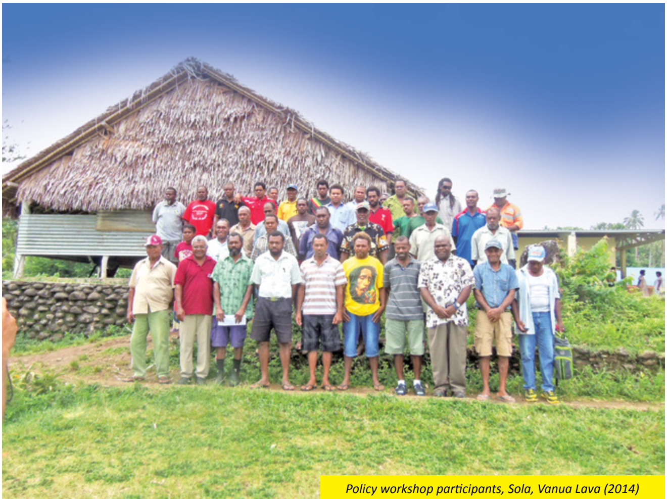
Policy workshop participants, Sola, Vanua Lava (2014)