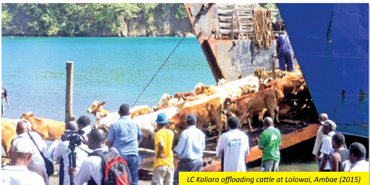
LC Kaliara offloading cattle at Lolowai, Ambae (2015)