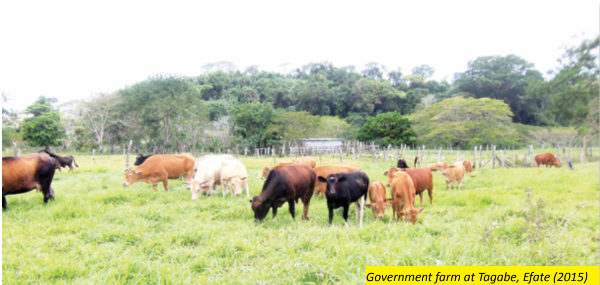
Government farm at Tagabe, Efate (2015)

“The livestock sector is modern, sustainably managed to benefit all its stakeholders, contribute to greater socio-economic development, and in its endeavours ensures sound environmental and climate proofing practices, including, achieving a national cattle herd of 500,000 heads by year 2025”.