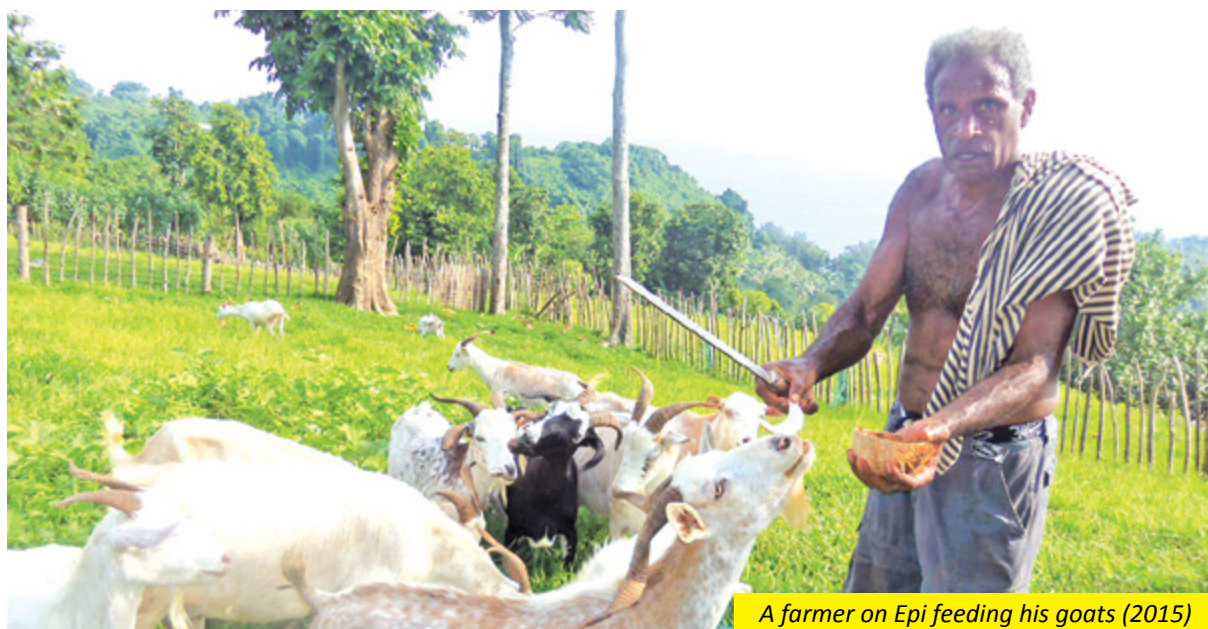
A farmer on Epi feeding his goats (2015)

A thorough elucidation of the 'way forward' is presented in the National Livestock Policy Action Plan, Monitoring and Evaluation Framework; it is made up of a series of policy directives, implementation strategies and evaluation mechanisms to address Vanuatu's livestock development challenges in a coherent and strategic manner. It is expected that this Policy framework will guide the development of the livestock sector to increase household incomes, assure food security, create employment, improve farming practices, enable environmental sustainability and adaptation to climate change and support other livestock-based commercial industries.