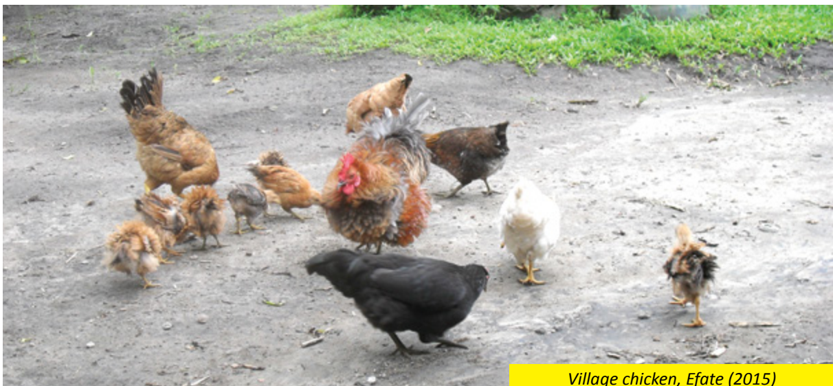
Village chicken, Efate (2015)

The National Livestock Policy and the National Livestock Sector Policy Action Plan, Monitoring and Evaluation Framework documents will be the guiding principle for livestock development for the next 15, from 2015 - 2030. The government and its stakeholders will review the policy and evaluate their performances against the Implementation Matrix every 3 – 5 years. Information and data collected must be regularly reviewed and analysed to assist with future development plans.