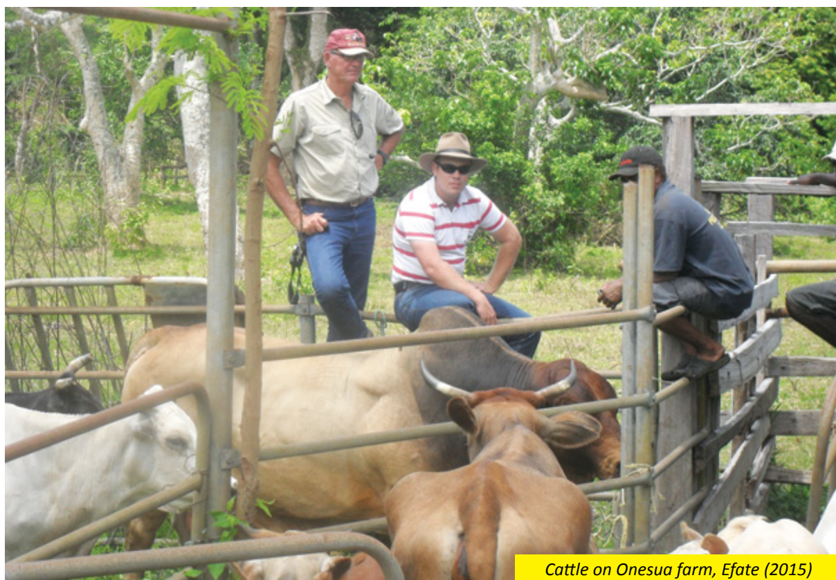
Cattle on Onesua farm, Efate (2015)

In order to improve the commercial livestock sector requires greater cooperation from the government and land owners. The government will encourage the sector to assist smallholder livestock farmers to develop and improve their farming systems through joint partnership with other farmers and to explore other development schemes.