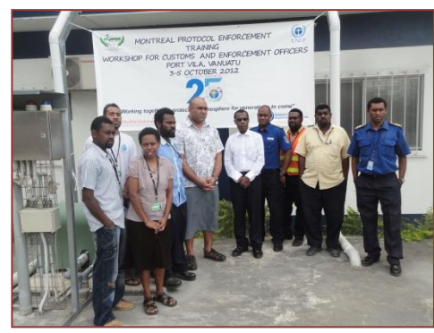
Figure 1: Customs Workshop, October 2012

The training took place from October 3 -5<sup>th</sup>, at the Customs Wharf Conference Room. The long-term objective of this training was to ensure that compliance to the Montreal Protocol in the Phase out of ODS is sustained. In addition, the training was also a chance to create awareness and capacitate law enforcement officials by providing the necessary skills set and knowledge that would strengthen and enable enforcement officials to effectively monitor ODS trade and its controls. The training was aimed to assist in the implementation of the Hydrochloroflorocarbon Phase-out Management Plan (HPMP) at the national level. Although there were a large number of invitations sent out (planned for 25 people) only 9 people attended; 6 out of the 9 were Customs and Border Control, 2 from the DEPC and one