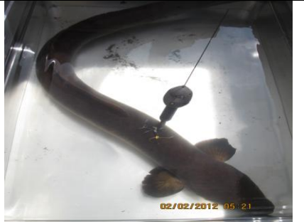
Tagged Anguilla megastoma. Ready to be released in the deep ocean...5km away from Gaua Island.